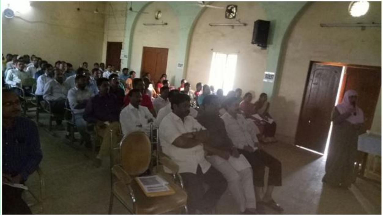
All the staff members listening about the revised accreditation framework